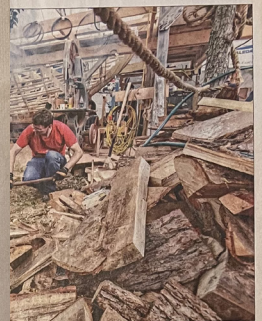
In the frames' workshop in September