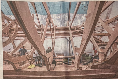
Steve Denette, left, and a crew of volunteers work inside the boat hull in mid-September trimming planks of rough-milled white oak for the all-wood Arabella.